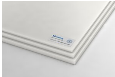
Polystone® PVDF HG natural

For more information about technical data, product handling, certifications, compliance or delivery program scan the QR-Code and visit our website or talk to our experts.